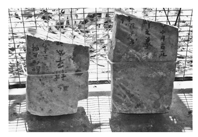
Photo 4 Japanese Tombstone (fragments) in Broome Historical Museum