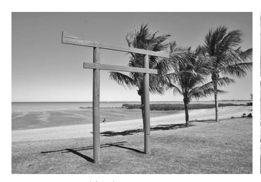
Photo 5 Torii(鳥居)or Shinto Shrine Gate on the Town Beach Park in Broome